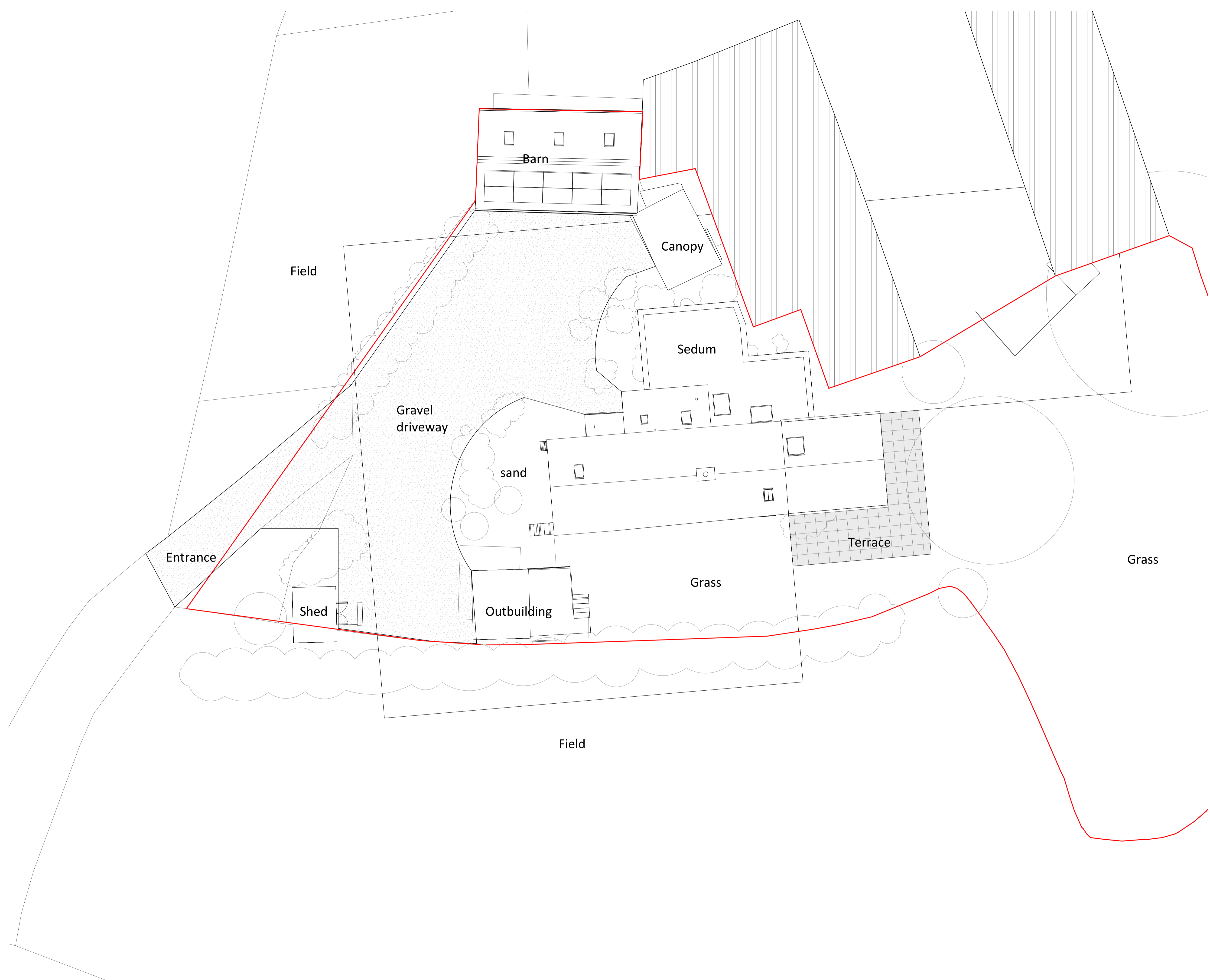
Proposed Site Plan 1 : 100

General Notes The copyright of this drawing and design remains the intellectual property of the designers and may not be used without the written permission of Great Space Architecture Limited. Do not Scale. Verify all dimensions on site before commencing work or preparing shop drawings. Report any discrepancies, errors or omissions to the designers and await further instructions before the commencement of works. All building materials, components and workmanship to comply with the appropriate public health acts, building regulations, British standards, codes of practice and the appropriate manufacturer's recommendations. Ensure all works are carried out by competent person. Refer to the relevant drawings or method statement for all specialist work.